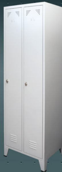
Two door lockers