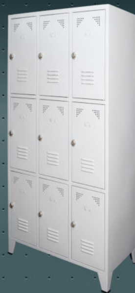
Nine Cell Lockers